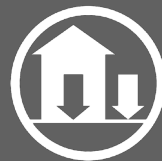
For internal and external use