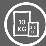
Available in 10kg and 2.5kg bags