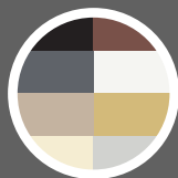
8 colours with matching silicones